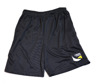
Grey microfibre sports shorts (with logo).

Although these items are regular range uniform it is advisable to have a spare set to change into for PE classes.