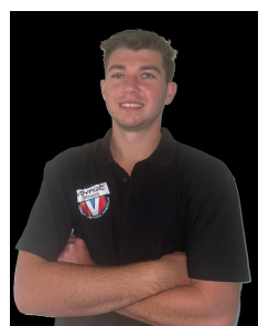
Cooper Alger Fitness and Conditioning